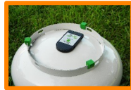
Connected Gas Tank Monitors