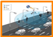
Smart City Lighting Systems