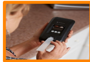
Connected Alcohol Monitors