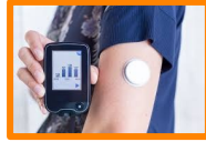
Connected Blood Sugar Monitors